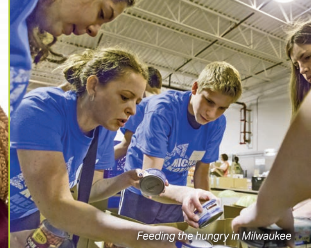
Feeding the hungry in Milwaukee

One gift supports the Federation and our network of local and international partners. We are hard at work 24 hours a day, 365 days a year, in Milwaukee, in Israel and in over 70 countries around the world.