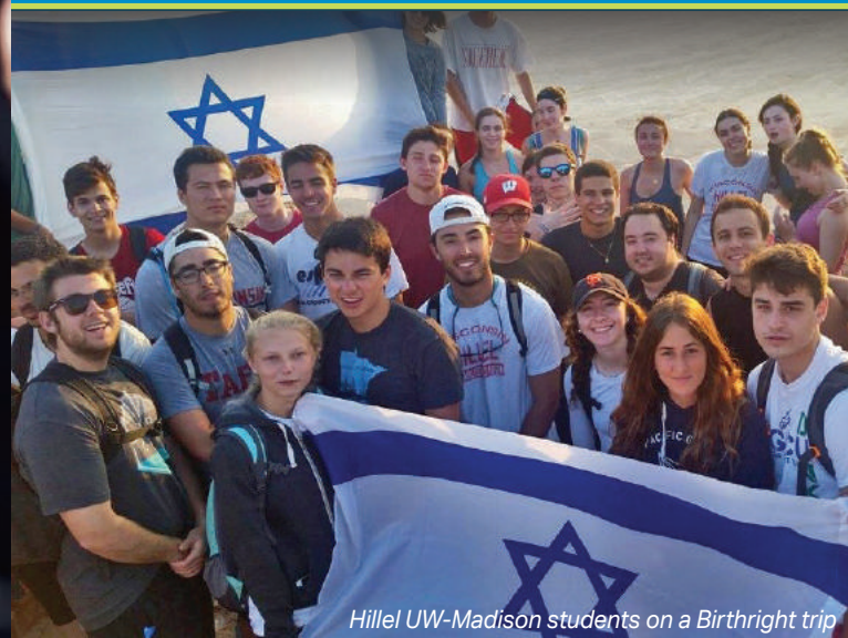
Hillel UW-Madison students on a Birthright trip