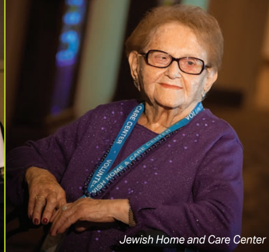
Jewish Home and Care Center