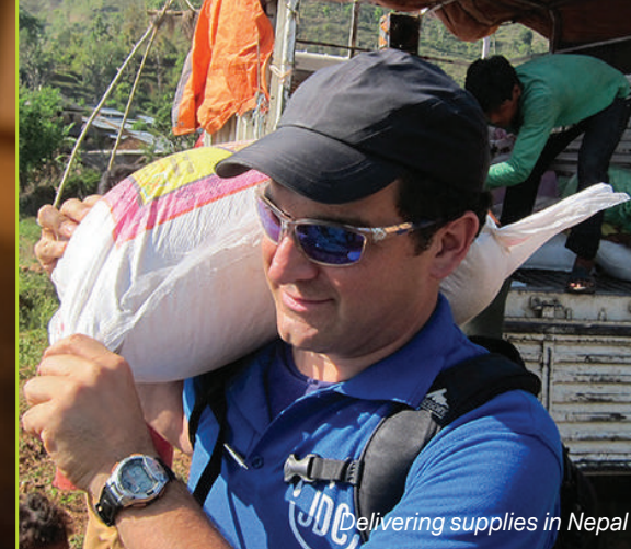
Delivering supplies in Nepal