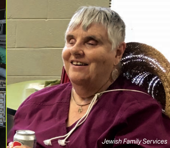
Jewish Family Services